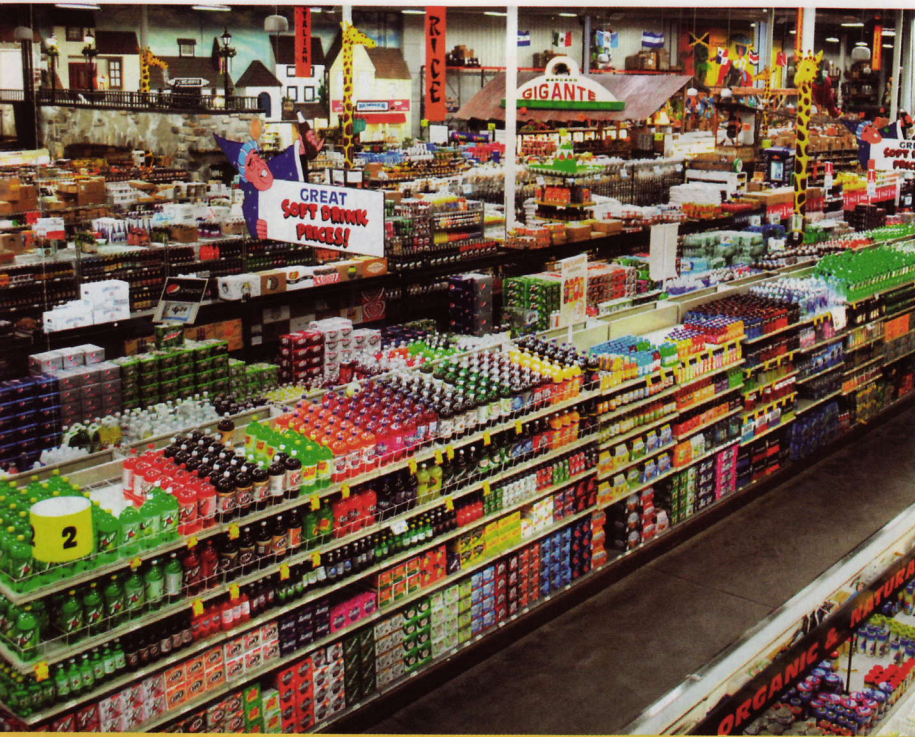
OPPOSITE: IKEA is known for its extensive selection of home furnishings and accessories showcased in 50 different room settings. ABOVE: Jungle Jim's International Market boasts more than 150,000 food items.

tion to current catalog items, visitors to the Frontgate and Grandin Road Outlet Center will also find discounted overstocked, out-of-season or slightly damaged merchandise. For more information, visit grandinroad.com/store-locs/content .